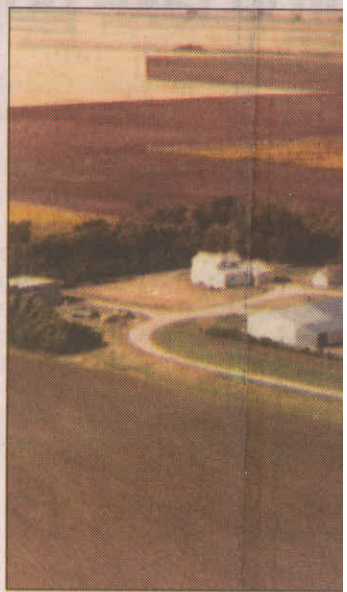
By the 1990s the Sletten farm was in the Sletten name.