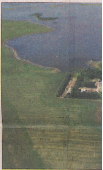
By 2010 the water of Devils Lake was impossible.