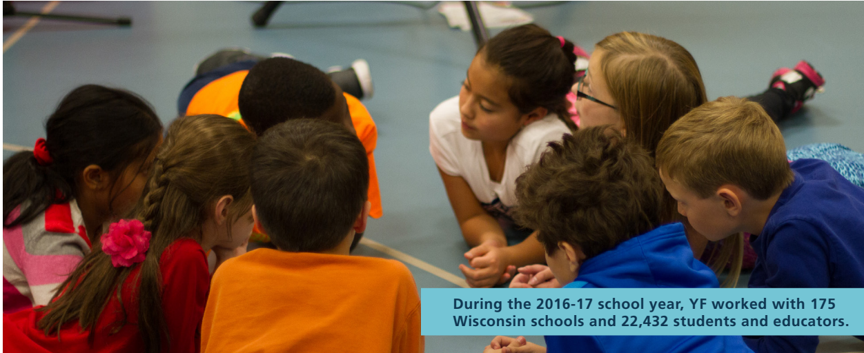
During the 2016-17 school year, YF worked with 175 Wisconsin schools and 22,432 students and educators.